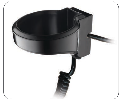
Wall Holder features Anti-Theft Cable tracks