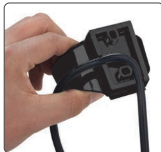
ANTI-THEFT LOCK Cable Track