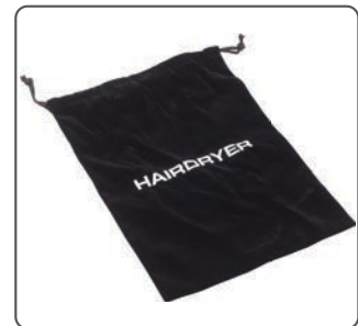
HAIRDRYER BAG Black Velvet