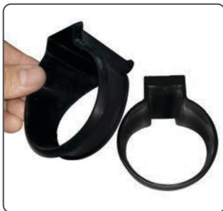
SOFT GLIDE Lining