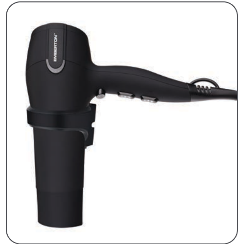
Converts to Wall Mounted with HOLDER option

For BEDROOM use only. NOT for use in BATHROOM or PUBLIC AREAS .